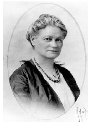
Hannah Solomon, NCJW Founder.

7 Summer at the Symphony, Gershwin 22 Summer at the Symphony, Casablanca